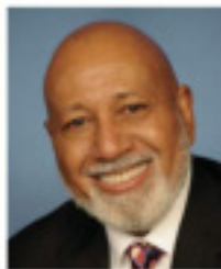
Alcee L. Hastings (D FL 20)