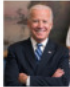
Vice President Joe Biden