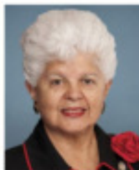
Grace F. Napolitano (D CA 32)

Here are the legislators who vote with us more than 90% of the time.