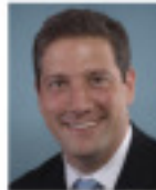
Rep. Tim Ryan