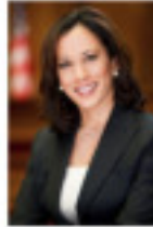
Senator Kamala Harris

The following shows how supportive the Democracy Primary candidates are on our issues.